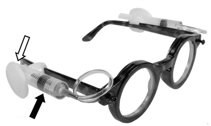
Fig 1 Adjustable spectacles: open arrow indicates adjustment knob, solid arrow indicates dioptre scale on user controlled pump. Lens can be sealed and adjustment mechanism removed after desired power is obtained